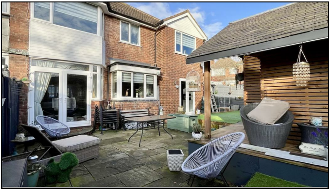
Chestergate Croft, B24 0NQ